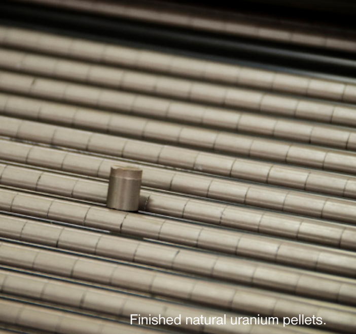
Finished natural uranium pellets.

The pellets produced at our Toronto facility go on to provide about 25% of Ontario's electricity!